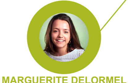
Corporate Partnership Specialist Soil Capital